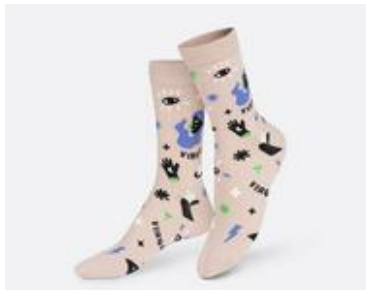
EAT SOCKS ZODIAC VIRGO